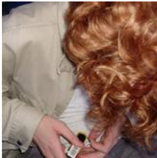
The BitlBee developer crew: